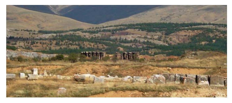
Ruins of Pisidian Antioch

n Acts 13:38-46 we read about Paul and Barnabas' work in Pisidian Antioch. After some of the Jews began to oppose them Paul describes the people as having judged "themselves unworthy of eternal life" (Acts 13:46). This doesn't mean that they didn't want eternal life. Everyone wants eternal life (if they recognize the need for it), but they didn't recognize that Paul of-fered the only means to eternal life. The gospel of Jesus Christ is the only true way to eternal life (Acts 4:9-12).