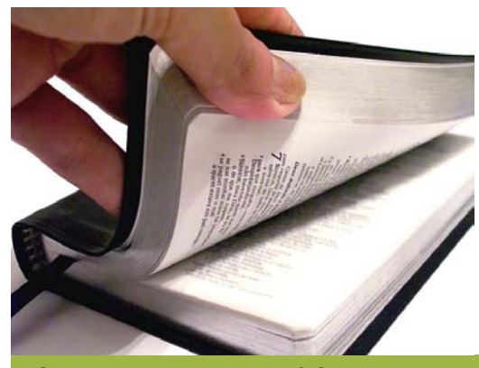
Olsen Park church of Christ

From the time the last book of the Old Testament was written until the Aleppo Codex was copied was about 1300 years. When compared to most other ancient manuscripts, such time gaps are not unusual. It was long believed that there would never be any