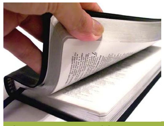
Olsen Park church of Christ

In these two situations, separated from each other by centuries, we see some powerful lessons that speak to us today.