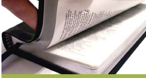
Olsen Park church of Christ