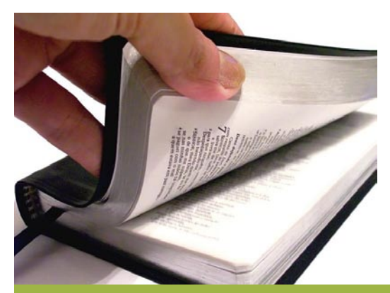
Olsen Park church of Christ

"Be Saved." We have already seen that the church is made up of those "registered in heaven" (Heb. 12:23). We have also seen that on the day of Pentecost, the Lord added to the church "those who were being saved" (Acts 2:47). Thus, the church by definition is made up of those members of Christ's body who are saved by His blood and added to Him. So, under these definitions we may say yes, only