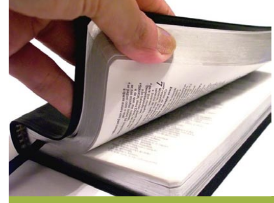
Olsen Park church of Christ

Some time back I heard about something which sounded like it came out of a science fiction or horror story. There is a company that operates in this country known as Cryogenic Solutions Inc. Reportedly this company works together with abortion clinics to freeze some of the cells of an aborted baby. The company then promises the woman who has the abortion that (for a fee) they can preserve the cells and then when the technology becomes available they can "regenerate" the child through a