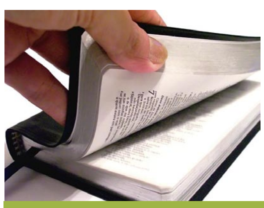
Olsen Park church of Christ