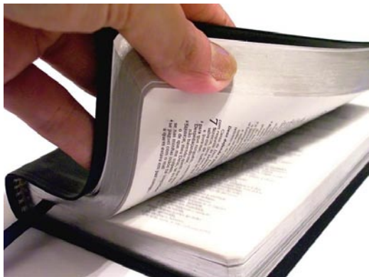
Olsen Park church of Christ