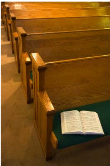
Olsen Park church of Christ

critical Greek texts (the United Bible Societies Greek New Testament, 4 th ed. and the Nestle-Aland Novum Testamentum Graece, 27 th ed.) rather than the Textus Receptus (the edition of the Greek New Testament first edited by Erasmus, and revised by various subsequent editors) on which the King James