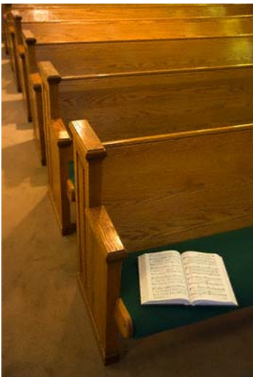
Olsen Park church of Christ

This parable has less to do with the na-