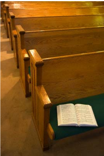
Olsen Park church of Christ

Notice, from the text above, three statements Paul was able to make.