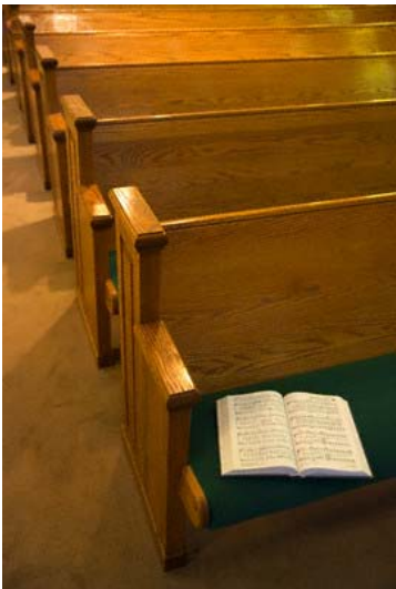
Olsen Park church of Christ

The Pharisees were the religious leaders and they were the ones that should have seen the signs the clearest and recog-