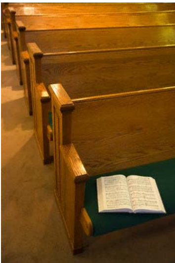
Olsen Park church of Christ

everyone. Paul wrote, “All have sinned and fallen short of the glory of God” (Romans 3:23). All who attain an accountable age will sin at some point. Even those who do not attain accountability will be affected by the consequences of other people’s sins.