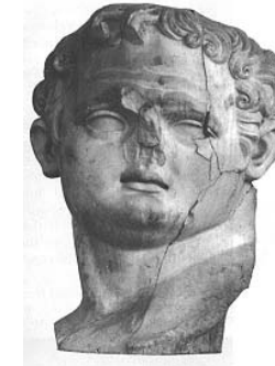
The Roman Emperor Titus

He wept over the city (19:41). Jesus then declared - "If you had known, even you, especially in this your day, the things that make for your peace! But now they are hidden from your eyes. For days will come upon you when your enemies will build an embankment around you, surround you and close you in on every side, and level you, and your children within you, to the ground; and they will not leave in you one stone upon another, because you did not know the time of your visitation." (Luke 19:42-44). When Jesus came to them, it was "their day," it was their "time of visitation,"